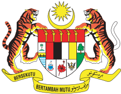
KEMENTERIAN KESIHATAN MALAYSIA

We work closely with our client to ensure that we deliver the best and most effective visual communications through amazing graphic design and great copywriting.