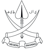
PEJABAT SETIAUSAHA KERAJAAN NEGERI PAHANG